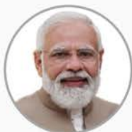
Shri Narendra Modi